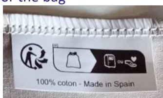
suggested label, 50x30 mm

Créabox and its partners can help you solve this French regulatory problem.